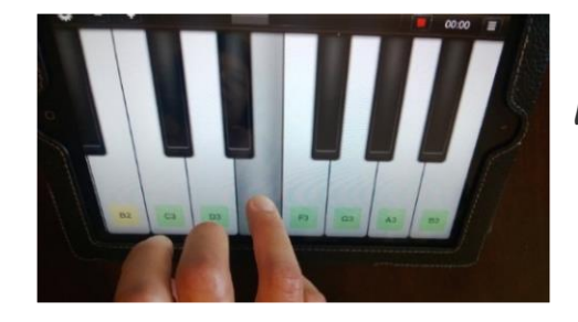
Note E (Mi)