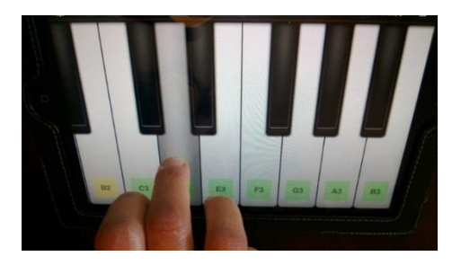
Note D (Re)